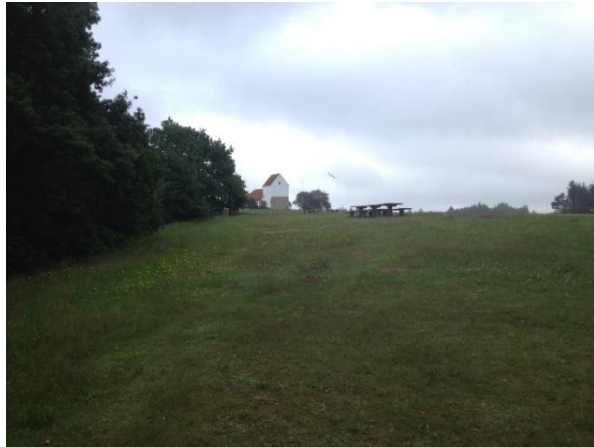
Follow the red arrows at this point you turn left and continue on the top of the valley otherwise you go down in the valley.