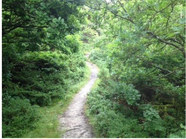
View cross the valley even on the top the way is full with lots of plants and trees.